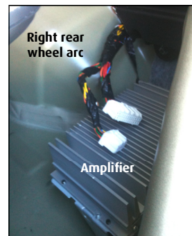
Amplifier in Kia Sportage