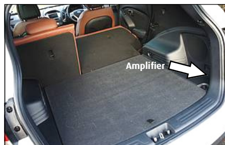
Amplifier location in ix35 / Tucson