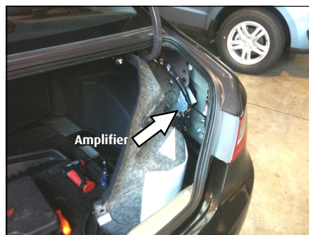
Amplifier location in i45 / Sonata