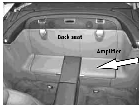
Amplifier location in Mercedes SL-Class R230