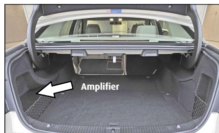
Amplifier location in E-class W212