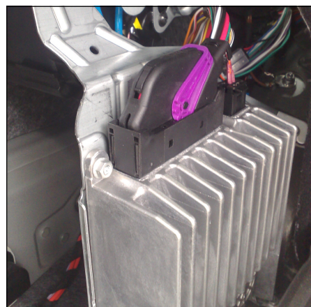
Picture of Amplifier in E-class W212