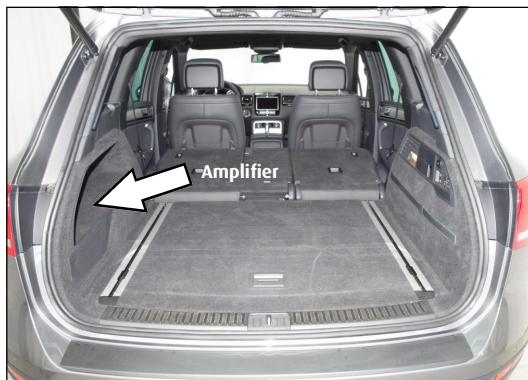
Picture of amplifier location