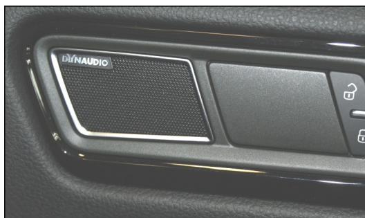
Picture of Dynaudio logo on speaker grill